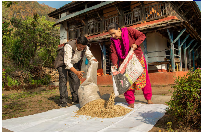
Coffee growers in Lamjung district.

The GreenToCompete Hub Nepal, hosted by Agro Enterprise Center, and NMB Bank signed an agreement on 28 September 2022 to scale up green financing for these farm businesses.